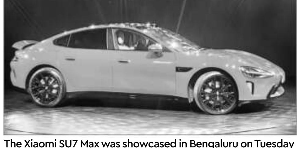
The Xiaomi SU7 Max was showcased in Bengaluru on Tuesday

With EVs, Xiaomi aims to deliver an integrated experience of its products, including smartphones, the internet of things (IoT), personal devices,