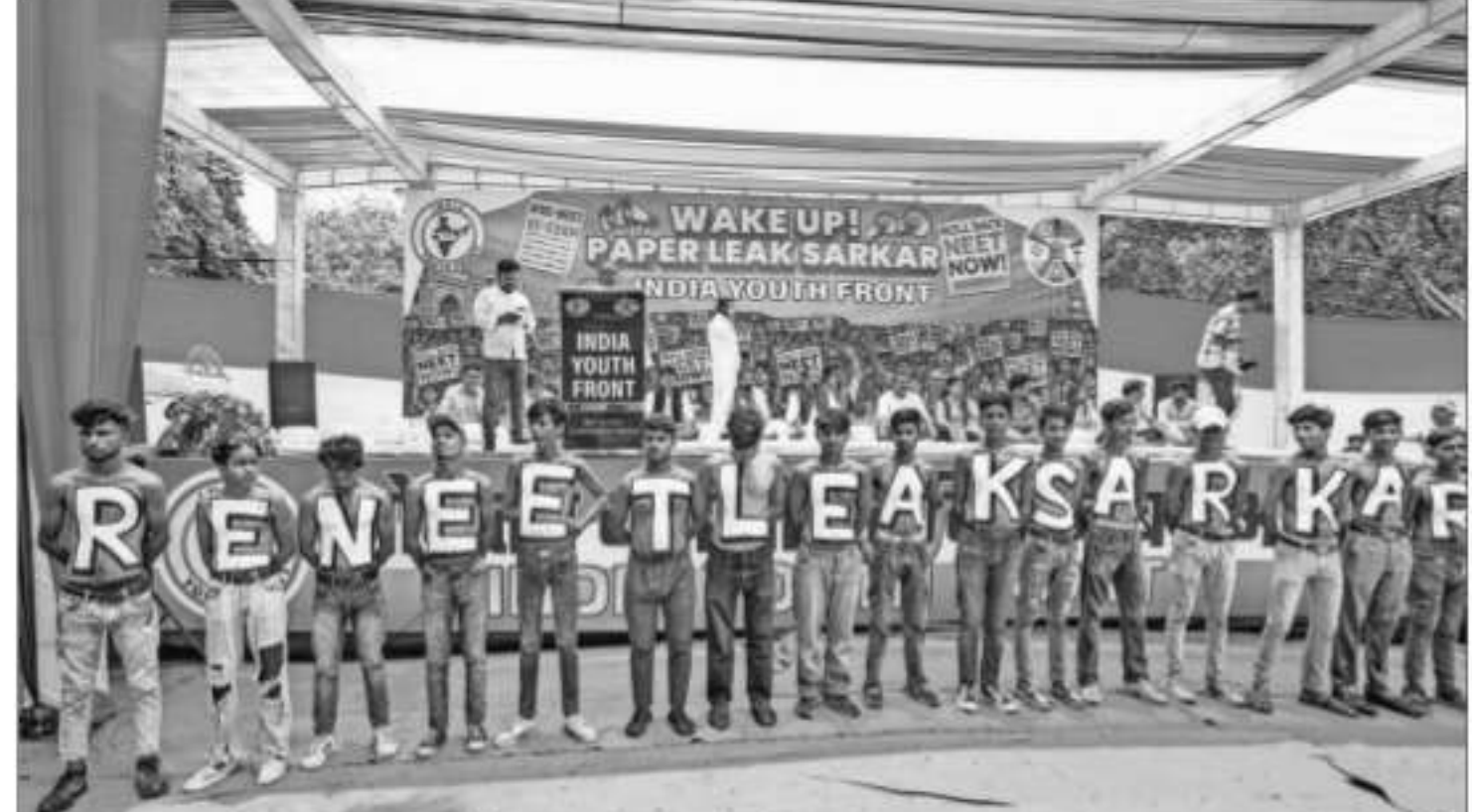
Members of the India Youth Front, an umbrella group representing youth wings of the opposition INDIA bloc parties, stage a protest over alleged irregularities in NEET at Jantar Mantar in New Delhi on Monday

The Supreme Court fixed the matter for a further hearing on July 11 and said it would decide on the merits after the government, the Central Bureau of Investigation (CBI), and the National Testing Agency (NTA) file their response to its queries. The NTA conducts the NEET UG exams and the CBI has been probing cases linked to the alleged leaks. It directed the Centre, the NTA and the CBI to file